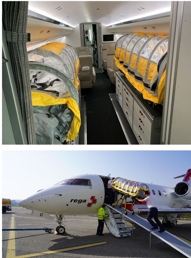
Fig. 3 PIU owned by the REGA. The REGA PIU is mainly used in the fixed wing aircrafts (Challenger 650) of the company. Transport of 2 PIU per flight are possible in the Challenger 650

study's data demonstrate that, although care and transport of COVID-19 patients may be handled in different ways in different European countries, it is nevertheless safe. As the number of patients with COVID-19 could increase, however, aeromedical crews must be able to adapt.