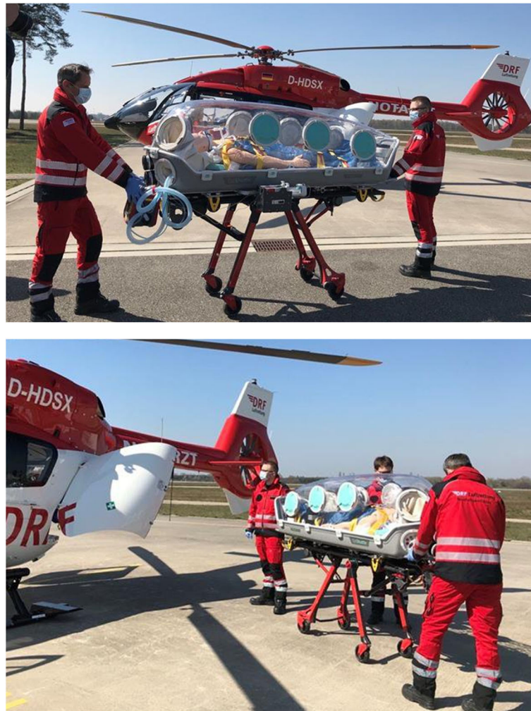
Fig. 2 The EpiShuttle® of the DRF-Luftrettung. The EpiShuttle is used only for interfacility transport. It is fitted into the helicopter (EC 145 / H 145) before the mission. The DRF-Luftrettung has an exemption according to article 71 (1) of regulation (EU) 2018/1139 by the “Luftfahrt-Bundesamt – LBA” (civil aeronautics board of Germany) to use the EpiShuttle in the Eurocopter 145 and Airbus Helicopter 145 rotor wing aircrafts of the company

The majority of patients treated needed medical interventions during the missions. Table 1 summarises some of the typical emergency and intensive care interventions. Patients who needed to be transferred to a higher-level medical facility (mainly interfacility transport) were more severely ill and needed significantly more mission-related interventions, except fluid therapy. Non-invasive ventilation (NIV), lung ultrasound and CPR—including ACCD—was used significantly more often in primary missions. During interfacility transport, ECMO was vital to ensure sufficient oxygenation in 14 patients (5.3%).