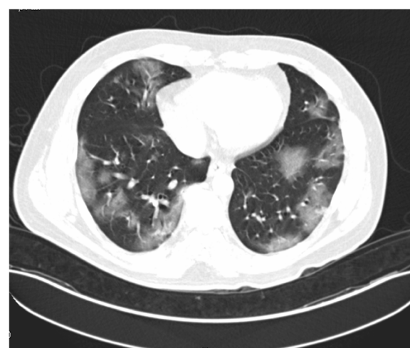
Fig. 2 Chest CT scan showing multiple bilateral and peripheral ground-glass and consolidative pulmonary opacities

While results were pending, we documented hypokalemia K 3.3, elevation of hepatic enzymes (aspartate aminotransferase 53 U/L, alanine aminotransferase 69 U/L), indirect hyperbilirubinemia (total bilirubin 2.07 mg/dl, indirect bilirubin 1.73 mg/dl, direct bilirubin 0.34 mg/dl), and elevated ferritin levels (595 ng/mL). The rest were