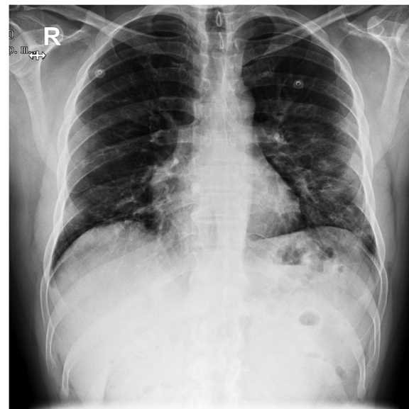
Fig. 1 Chest X-ray showing multiple ground-glass bilateral infiltrates

A 43-year-old man was brought to the emergency department by his mother for altered mental status. She reported her son's symptoms had started 3 days after his father was diagnosed with COVID-19. The patient presented with tachylalia, disorganized ideas, restlessness, delusions of grandeur, emotional lability, hetero-aggression, and aggression towards his mother. His mother revealed a past history of hetero-aggressive episodes which usually resolved during 48 h. Episodes did