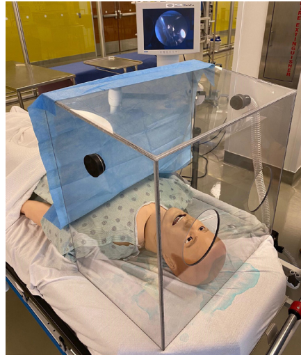
Figure 1 Use of the aerosol containment device for a simulated intubation procedure.

In response to the need to further protect our healthcare providers, we collaborated with HYL to adapt the design of his 'aerosol box,' a clear plastic barrier device to shield clinicians from aerosolised particles during airway procedures. 4 Hospitals around the world have begun manufacturing these